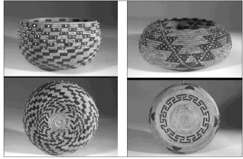
Pomo baskets (w/ beads & woodpecker feathers), American Museum of Natural History Photos provided

Many collections were made at a time when the Indian people were poor, starving and or in great sorrow and pain. Selling their ceremonial items