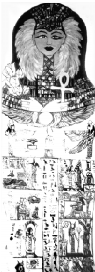
Michele's cremation container cover