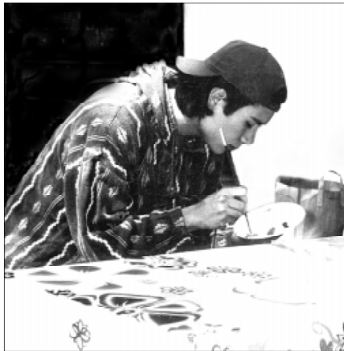
Twenty year old son paints his mother's cremation container

For children to become acquainted with death as a part of life is vitally important and can free them from unknown fears. Many families have approached us to ask whether we thought it was appropriate to include children in the ceremony. They were concerned that it might be too much for them. We tell them that children seem to handle home funerals very well. They tend to take their cue from adults. We also see children who are very connected and comfortable around the person who has died even leading the way for the adults. In one family, the son and daughter-in-law had a five-year-old daughter and were very concerned about her being around her deceased grandfather. The little girl ended up bringing people into the room, sitting with them quietly, and talking to grandpa—becoming a model of sensitivity and peace for the distraught grown-ups around her.